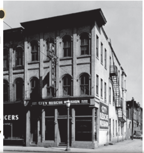
The former Vendome Hotel is purchased by the Mission for $25,000 in 1924. An illuminated cross sign was installed in 1926 to be a beacon for the lost.

Just imagine bustling streets teeming with people, street cars, and carriages. Businesses were booming, but there were also many on the streets that were poor and destitute. Many families were dealing with the ravages of alcoholism and poverty. That is what it was like in New Castle back in 1911 when the City Rescue Mission was founded. During the early years, there were many challenges for those running the Mission, but there were a lot of ministry opportunities as well. In 1913, wide-scale flooding gave the Mission an opportunity to earn respect from the community by ministering to flood victims in need of clothing, mattresses and food. A Sunday School and a Sewing School were started to minister to and teach children.