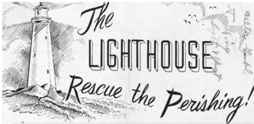
The Lighthouse, the Mission's newsletter, was first issued in 1949

In 1957, a new warehouse was built on Cascade Street which housed the Industrial Department and later a thrift shop. Many men staying as guests in the Mission's shelter received "work therapy" at the Industrial Center. In 1959, at the end of the first half of the Mission's century of service, a new illuminated cross sign was purchased and installed on the Mission's building. On the sign is: Christ our Creed, Love our Law, JESUS SAVES. This cross sign still shines today as a beacon of hope to all who come.