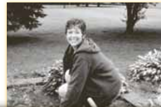
The Women's Group of Hillcrest Presbyterian (Volant) helped to beautify the flower beds and grounds at Covenant House.

to our shelter guests. No matter how they served, they all put their faith into action, all for the glory of our Lord and Savior, Jesus Christ!