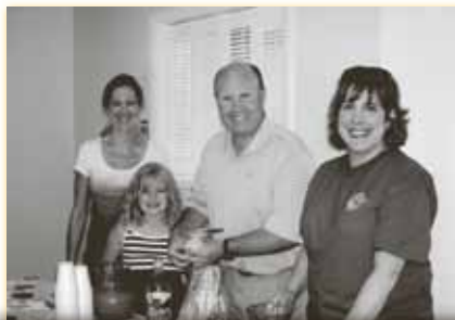
Lots of fun was had by all when this Bible study group hosted a Birthday Party for the Men's Ministry.

shape, or by working in our kitchen or by offering care and kindness