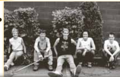
This hard working group takes a much deserved break after landscaping at our Cascade Street warehouse.

This summer we had many groups join us here on the mission field. They came from near and far; one group came all the way from Wisconsin! The Senior High Work Camp made up of young men and women from Ohio Presbyterian (Hopewell) and Hiland Presbyterian (Pittsburgh) spent a week with us and helped with painting, landscaping, roofing, and even more. Other groups joined in the fun by helping us to keep our facilities in tip-top